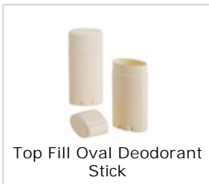
Top Fill Oval Deodorant Stick